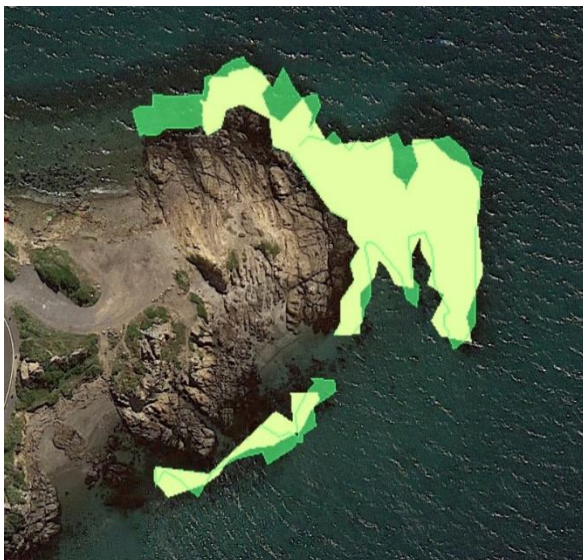
Dec 2021 (green, 2,447m 2 ) & Dec 2022 (yellow, 2,095m 2 ).