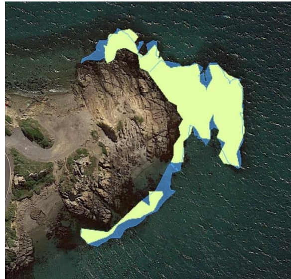
June 2022 (blue, 2,525m 2 ) & Dec 2022 (yellow, 2,095m 2 ).

On 3 rd December 2022 the urchin removal phase for the iwi-led controlled kina removal project commenced. More information on www.kinaowhanganuiatara.nz .